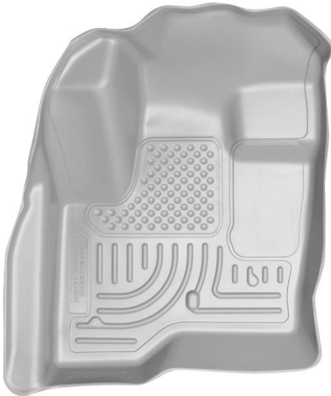
LEFT OR DRIVER'S